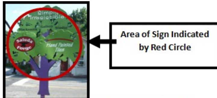
Example Illustrating Measurement of the Area of an Irregularly Shaped Sign

SIGN AREA. The size of a sign in square feet as computed by the area of not more than two (2) standard geometric shapes (specifically circles, squares, rectangles, or triangles) that encompass the shape of the sign exclusive of the supporting structure.