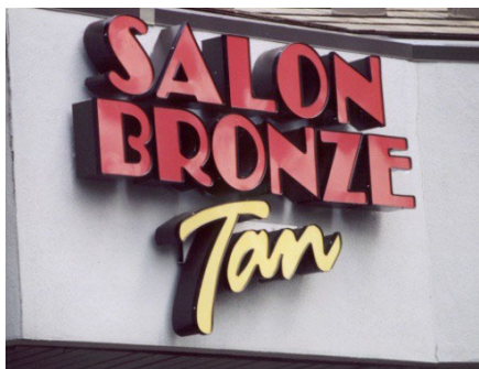
Example of Channel Lettering

CHANNEL LETTERING. A sign design technique involving the installation of three-dimensional lettering against a background, typically a sign face or building façade.