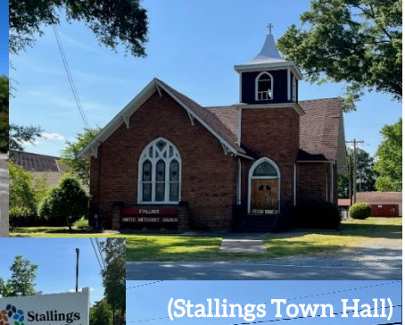
(Stallings Town Hall)