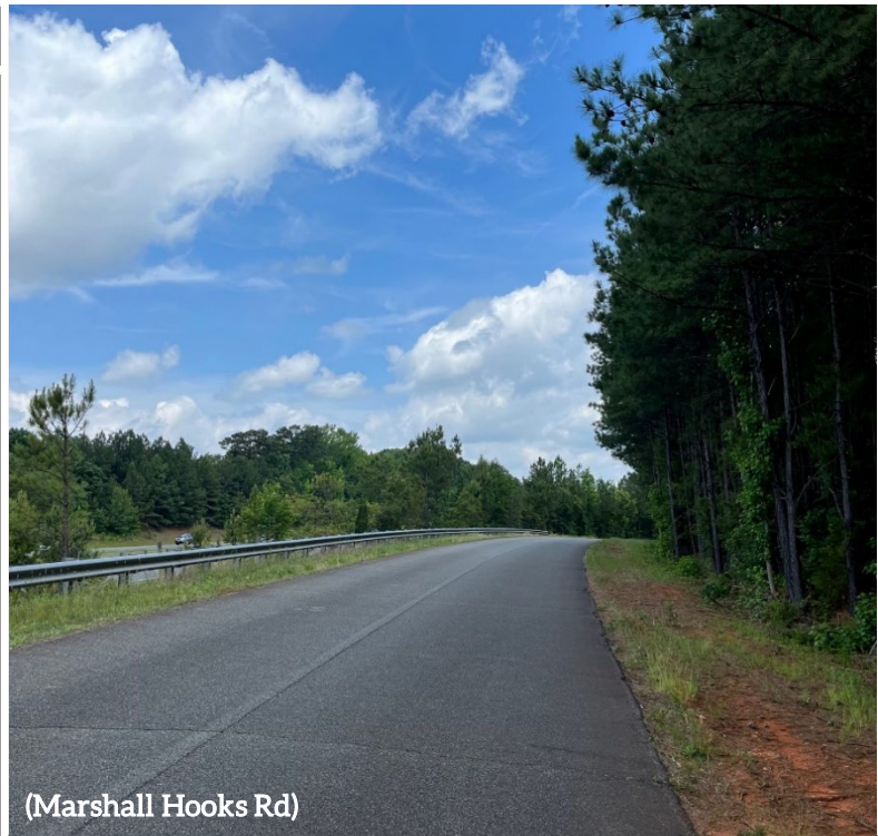
(Marshall Hooks Rd)

The goals of this district include providing a pleasant and safe environment for motorists and pedestrians and a focus on preserving the capacity of the Outer Belt to accommodate high traffic volumes at higher speeds outside the core area.