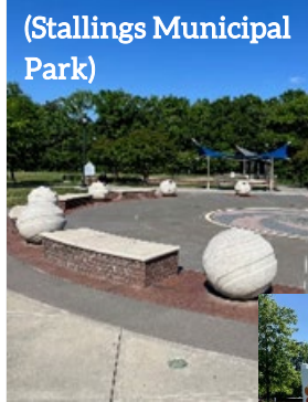
(Stallings Municipal Park)

Providing a unique district for civic and institutional uses will establish uniform standards. Parking should not be the dominant visible element of the campuses developed for institutional uses.