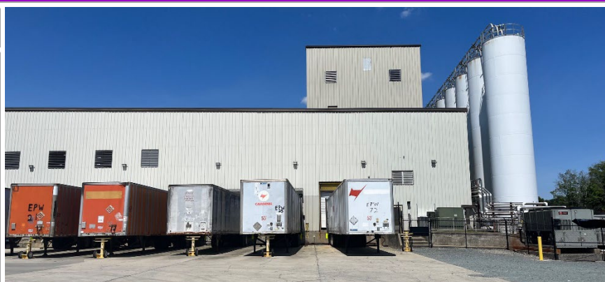
(Berry Global, 303 Seaboard Dr)

The Industrial District is reserved for uses that require large buildings and/or parking and loading facilities.