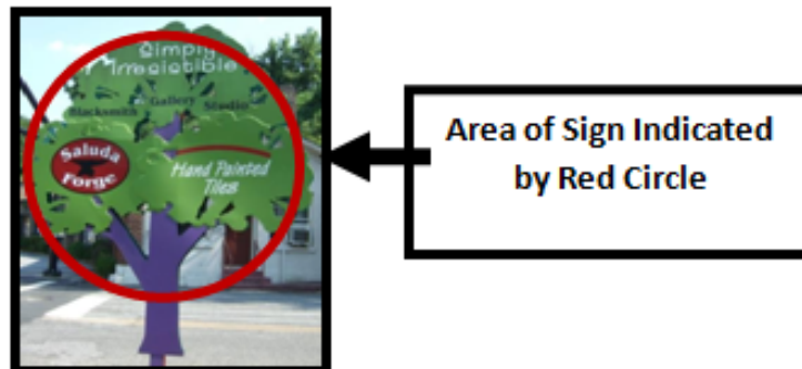
Example Illustrating Measurement of the Area of an Irregularly Shaped Sign

SIGN AREA. The size of a sign in square feet as computed by the area of not more than two standard geometric shapes (specifically circles, squares, rectangles, or triangles) that encompass the shape of the sign exclusive of the supporting structure.