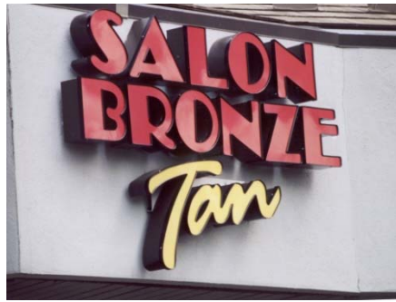
Example of Channel Lettering

CHANNEL LETTERING. A sign design technique involving the installation of three-dimensional lettering against a background, typically a sign face or building façade.