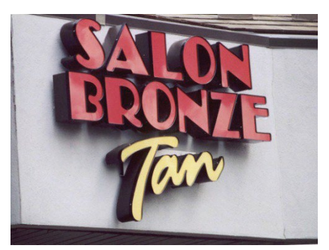
Example of Channel Lettering

CERTIFICATE OF COMPLIANCE/OCCUPANCY. A statement, signed by the Enforcement Officer,