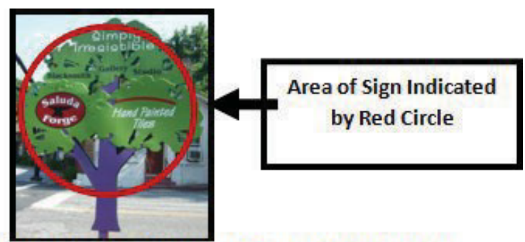
Example Illustrating Measurement of the Area of an Irregularly Shaped Sign

SIGN COPY. Any graphic design, letter, numeral, symbol, figure, device, or other media used separately or in combination that is intended to convey information or a message, including the panel or background on which such media is placed.